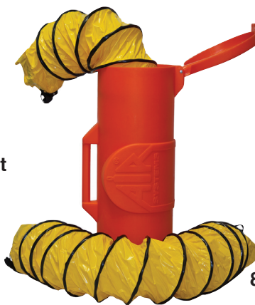
8" Electric Blower Kit SVB-E8SCUP